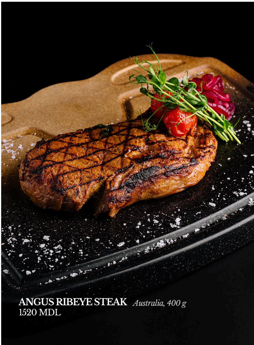
ANGUS RIBEYE STEAK Australia, 400 g 1520 MDL