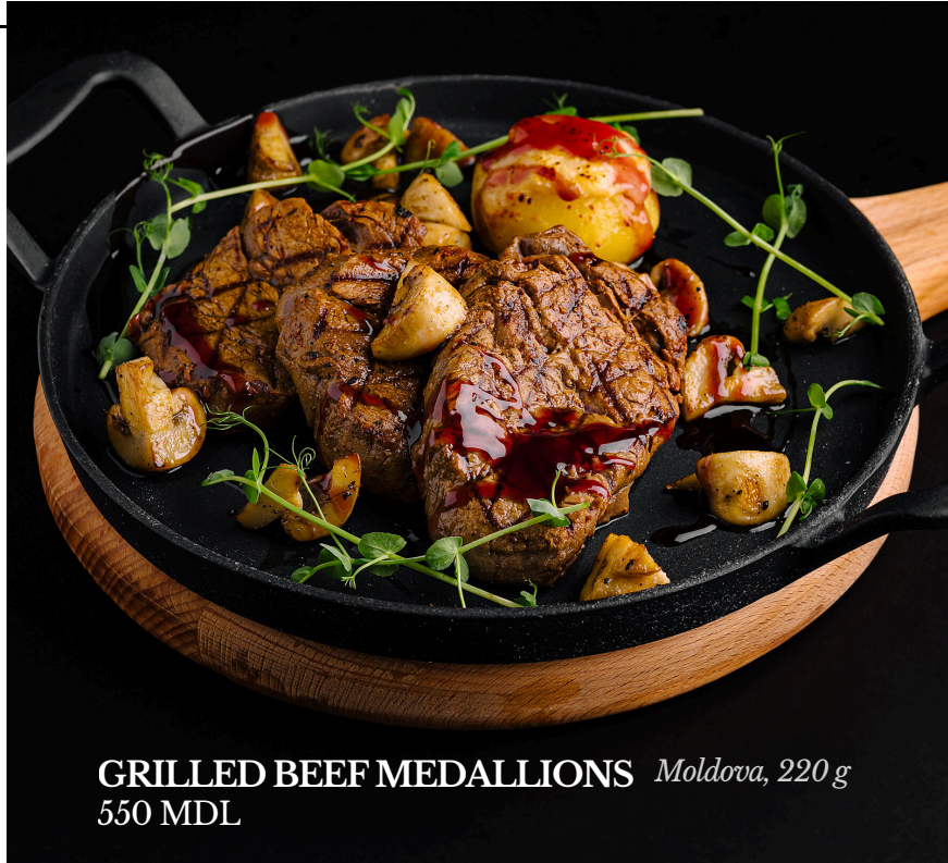
GRILLED BEEF MEDALLIONS Moldova, 220 g 550 MDL