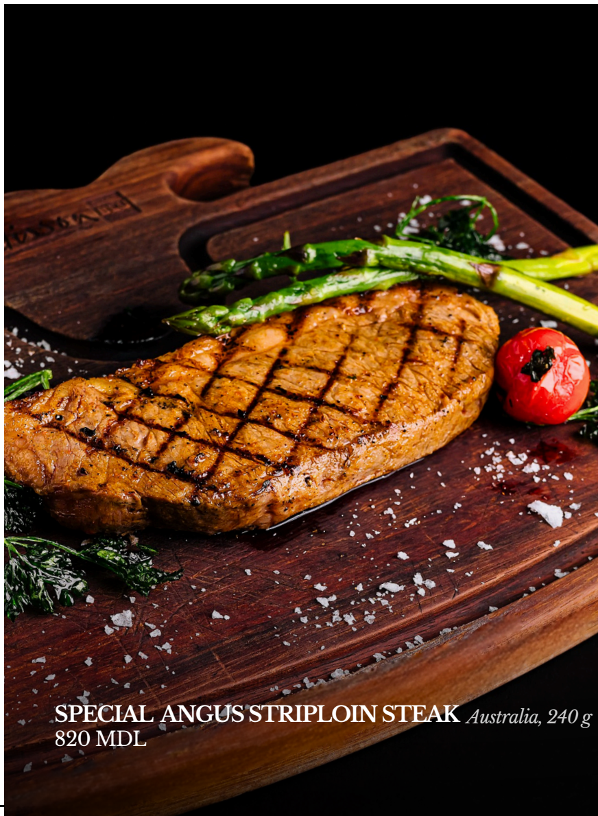
SPECIAL ANGUS STRIPLON STEAK Australia, 240 g 820 MDL