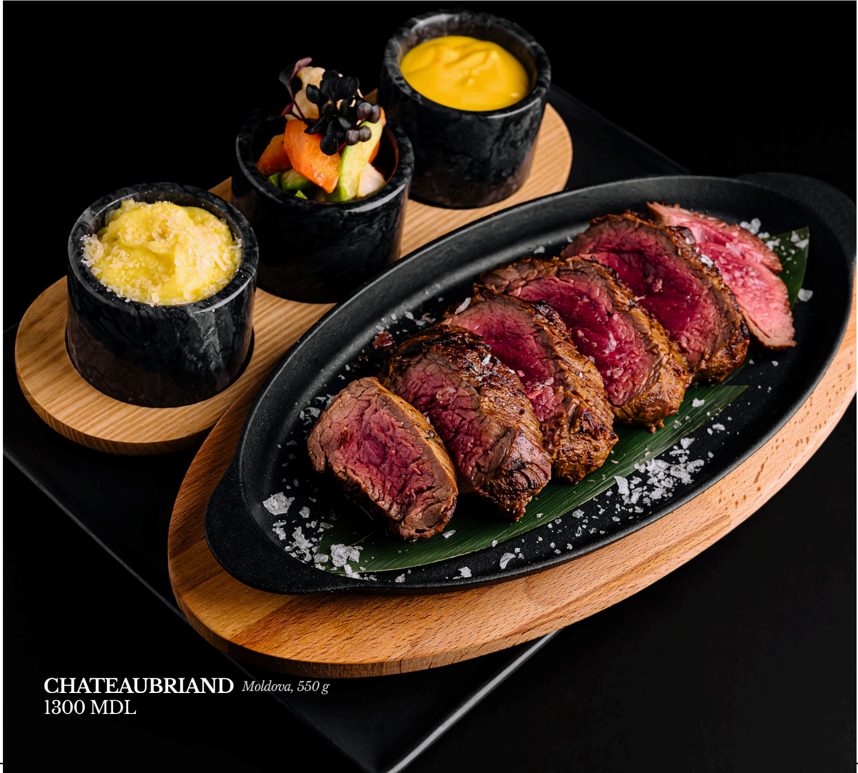
CHATEAUBRIAND Moldova, 550 g 1300 MDL