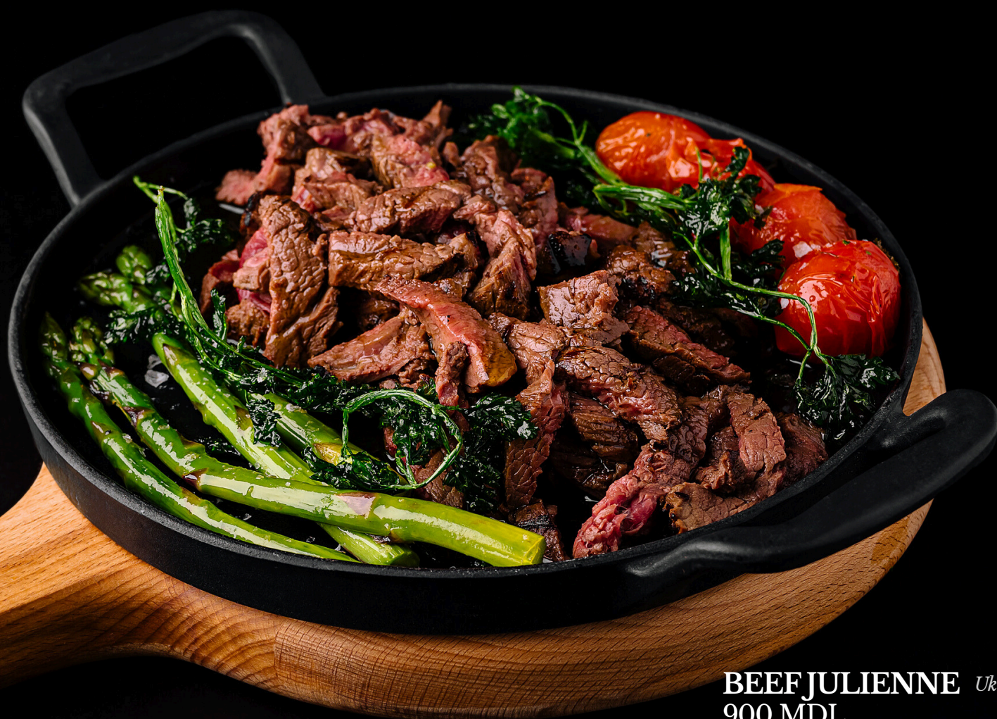
BEEF JULIENNE Ukraine, 350 g 900 MDL