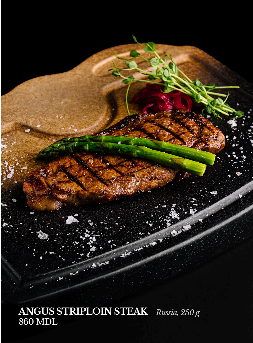
ANGUS STRIPLON STEAK Russia, 250 g 860 MDL