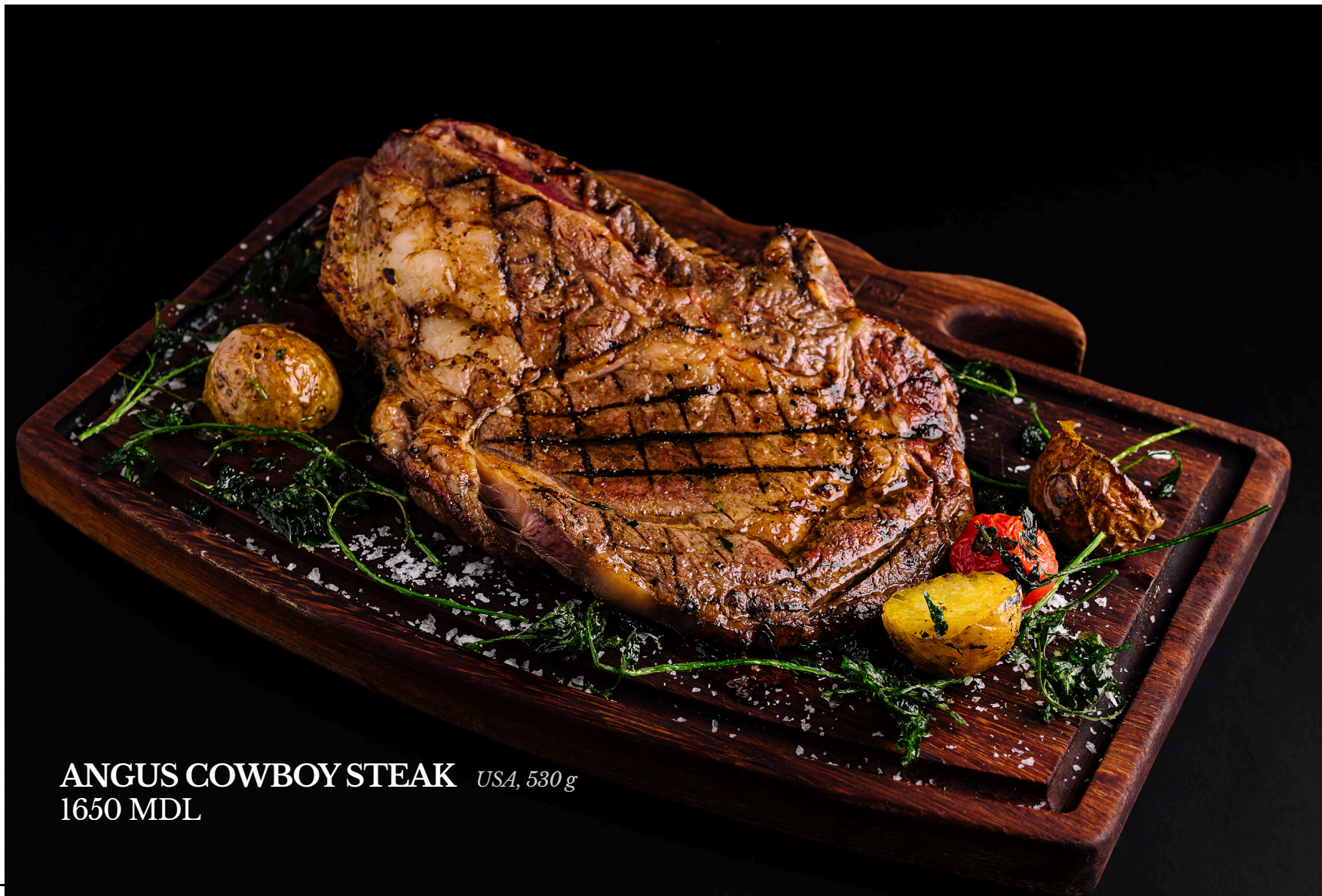
ANGUS COWBOY STEAK USA, 530 g 1650 MDL