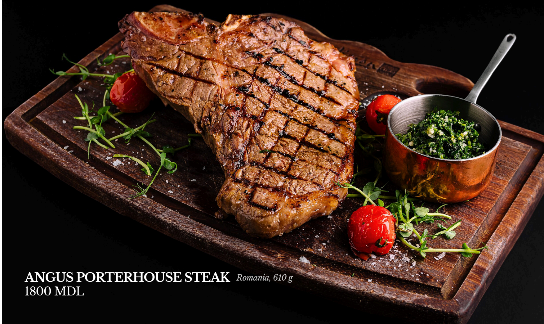
ANGUS PORTERHOUSE STEAK Romania, 610 g 1800 MDL