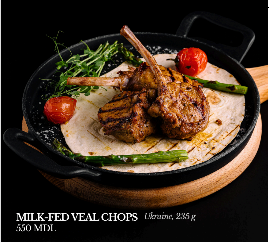
MILK-FED VEAL CHOPS Ukraine, 235 g 550 MDL