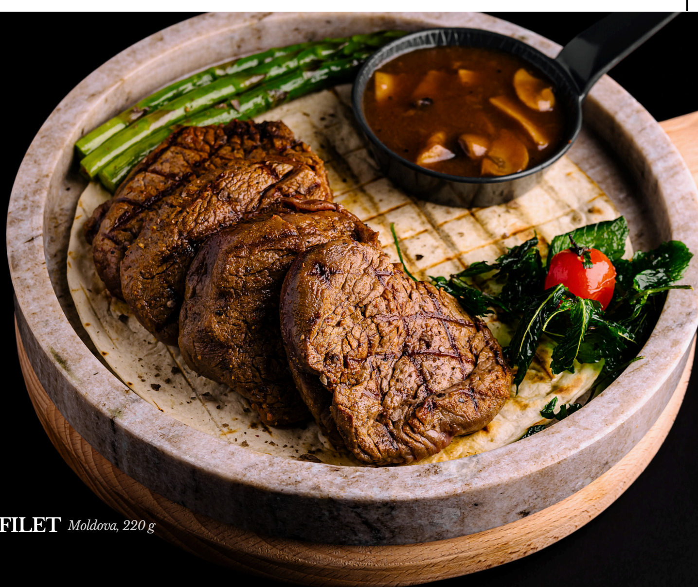
COEUR DE FILET Moldova, 220 g 550 MDL