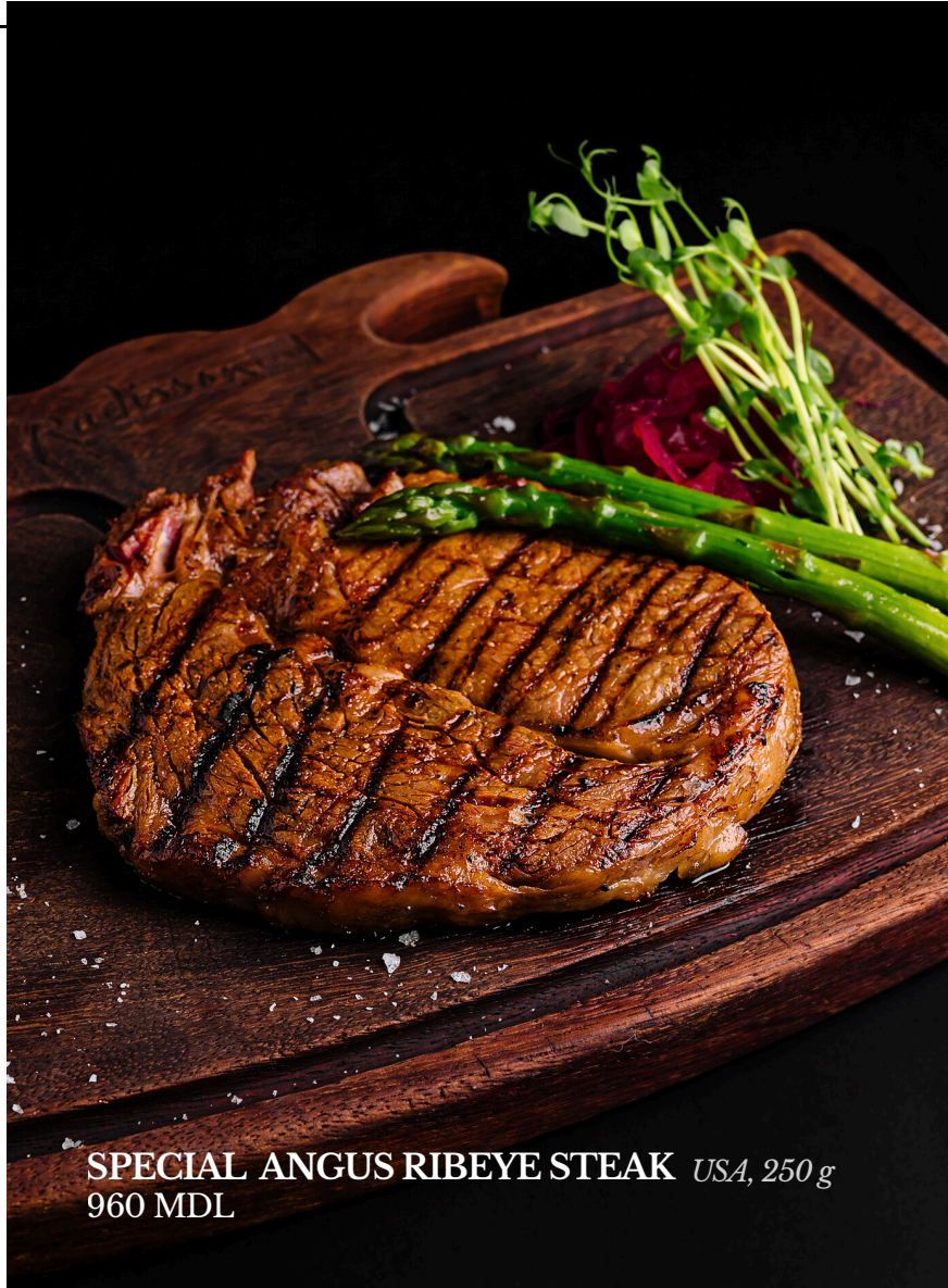
SPECIAL ANGUS RIBEYE STEAK USA, 250 g 960 MDL