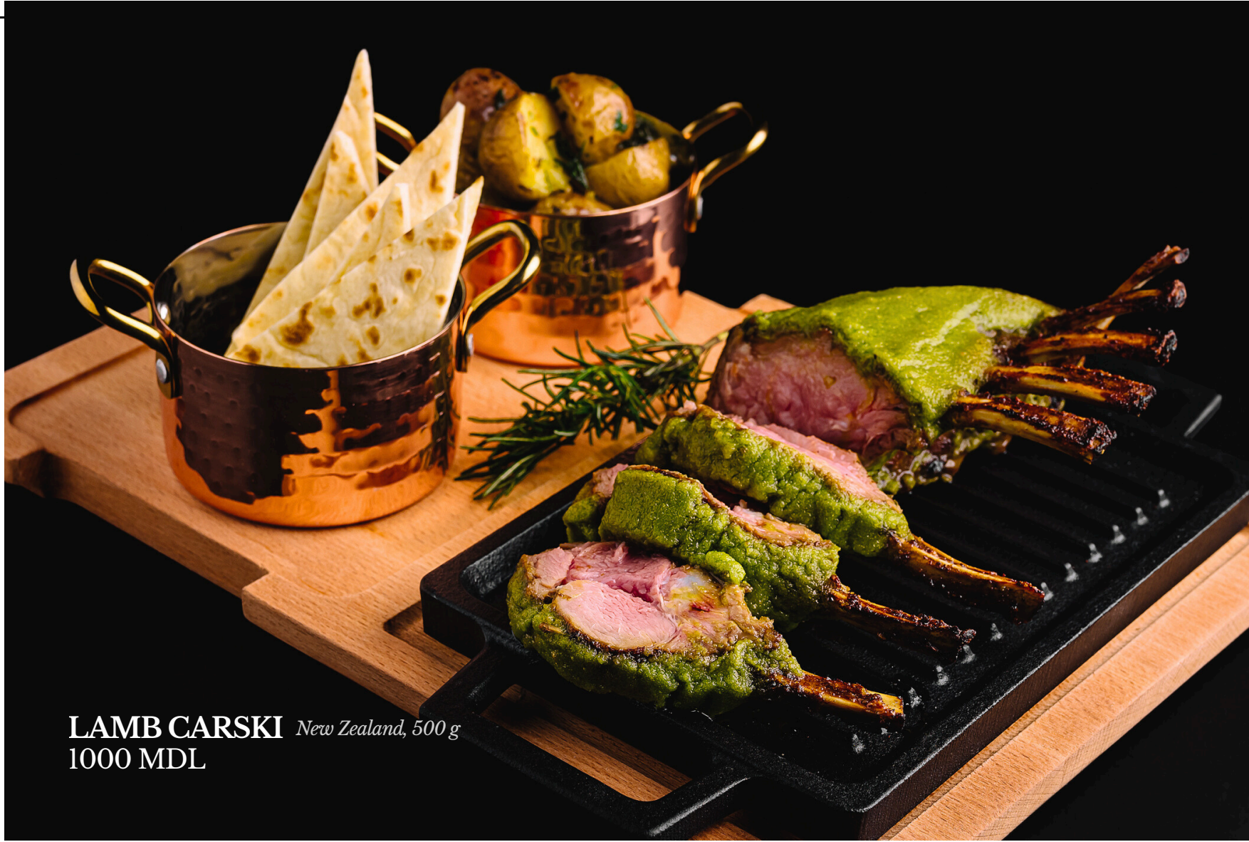
LAMB CARSKI New Zealand, 500 g 1000 MDL